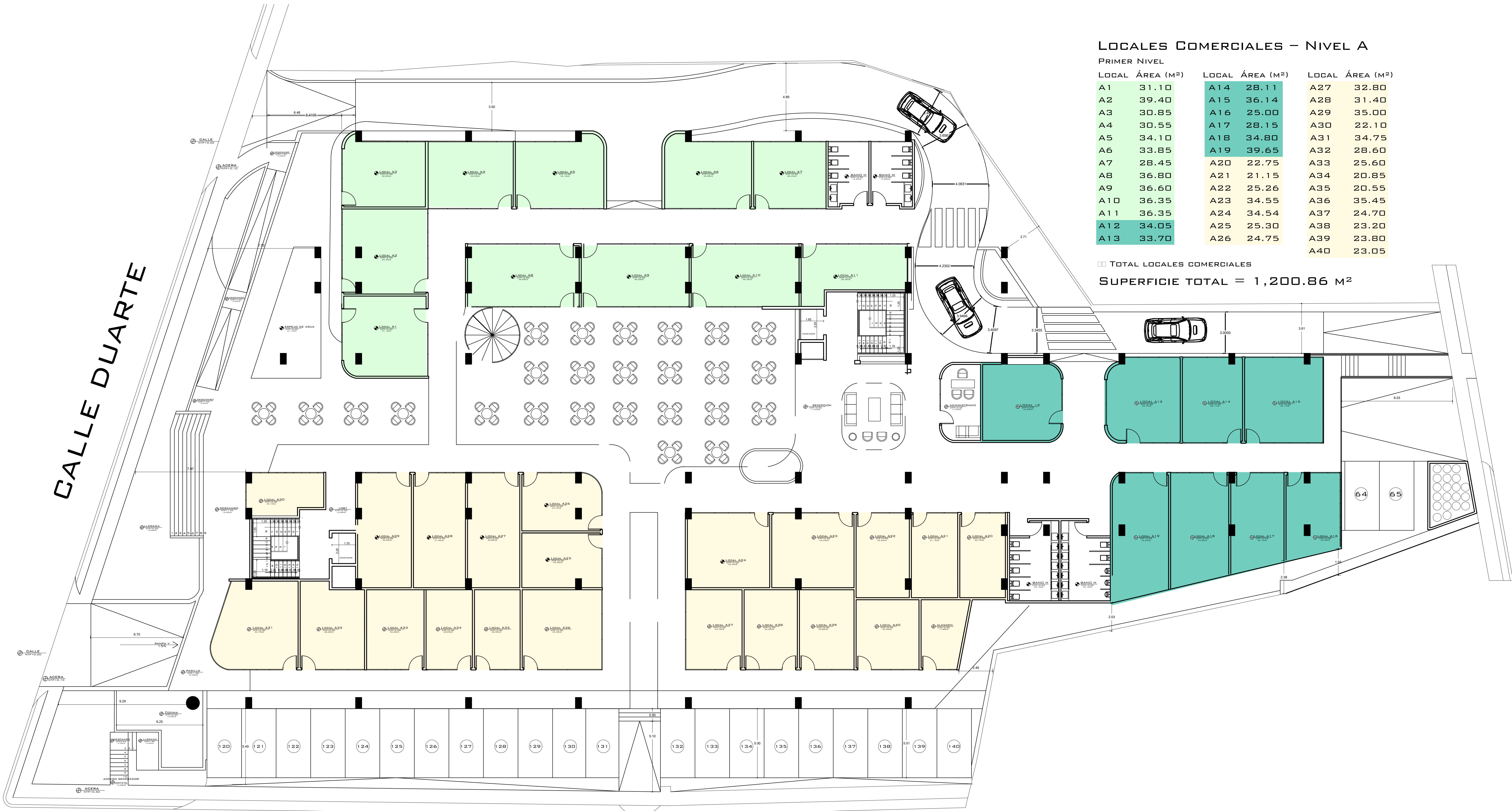
PLANTA DE AREAS PRIMER NIVEL